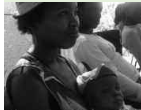
The support group gives the young women a chance to finish high school and empower themselves.

This past January twenty teenage girls started making preparations for the upcoming school year. Many of these girls could not attend school last year as they had to worry about whether their young babies would have enough to eat. Today, they can concentrate on finishing high school and finding multiple ways to empower themselves and their children. Each week, these teenage girls attend one of Ubuntu's eight support groups with facilitated discussions and workshops, focusing on reproductive health, HIV risk reduction and positive living skills. All group members receive comprehensive care ranging from academic guidance and tutoring to food parcels and intense psychosocial support.