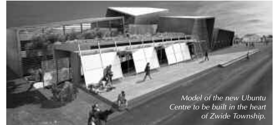
Model of the new Ubuntu Centre to be built in the heart of Zwide Township.

In the past nine years, our programmes have grown to reach 40,000 vulnerable children and their families with health and education services. Our staff has grown from 2 people to 55 full-time staff and 20 volunteers. Our current office no longer has enough space to provide the support this little girl